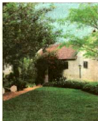
SERENE OASIS: Temenos