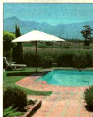
SPLENDID: Villa Tarentaal